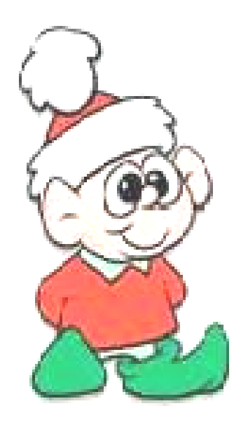
PLEASE SEE PG 3 FOR INFORMATION RE: CLASS PARTIES & WATER FUN DAY