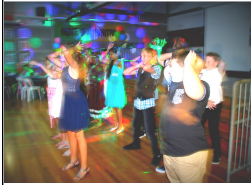
AIM HIGH - BE BRAVE !!!